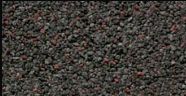
SLATETONE GREY ●