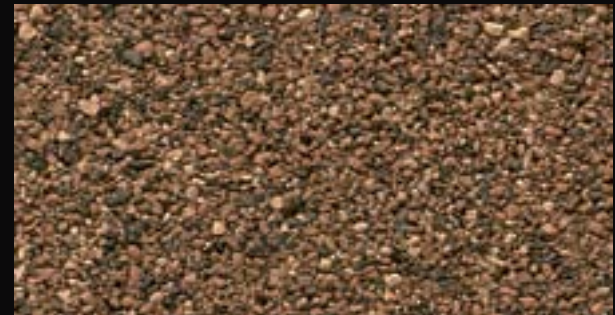
RUSTIC CEDAR ●◆