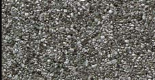
GREY BLEND ●