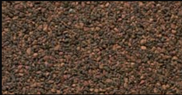
TWEED BLEND ●