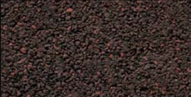
RUSTIC REDWOOD ●