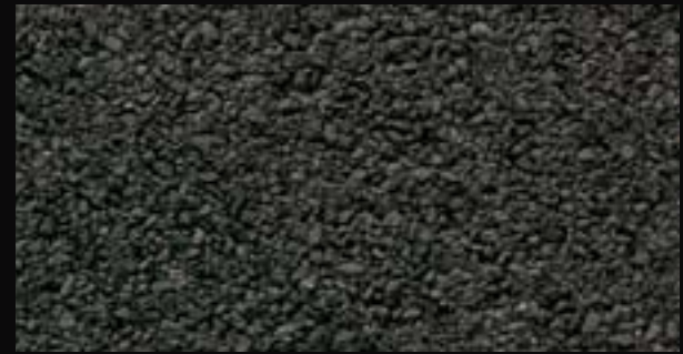
RUSTIC BLACK ●◆