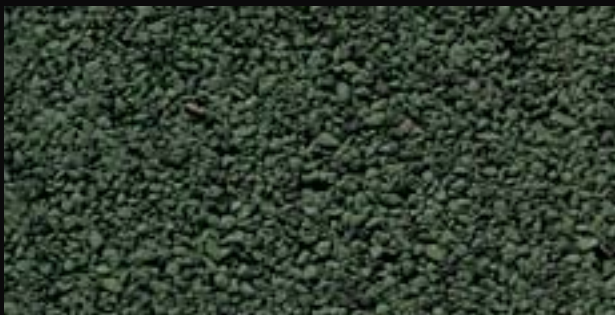
EMPIRE GREEN BLEND ●