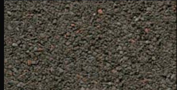
WEATHERED WOOD ●◆