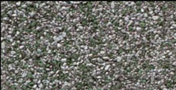
PASTEL GREEN ●