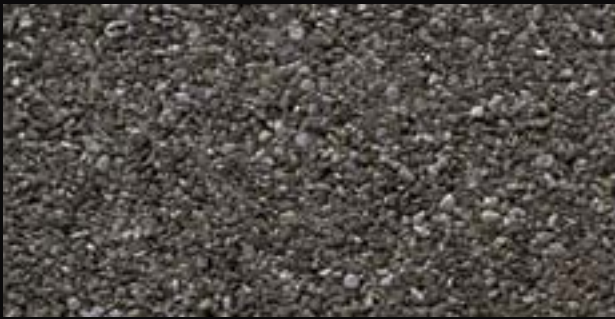
ANTIQUÉ SLATE ●◆